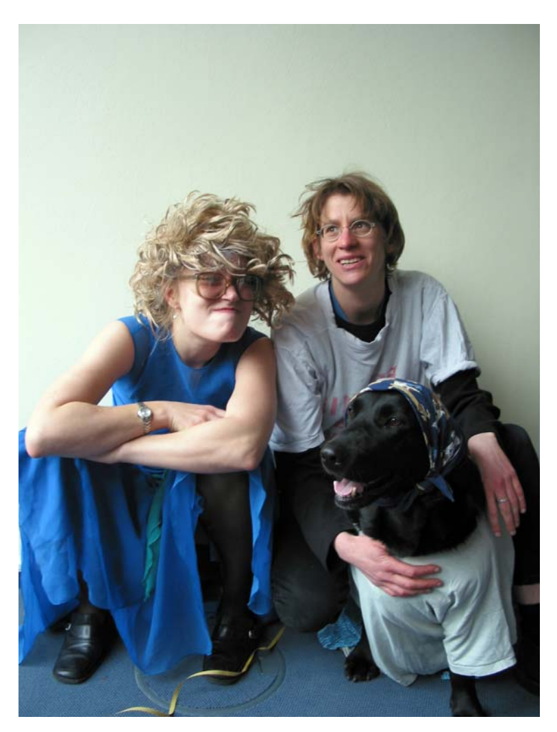
The research team during undercover fieldwork