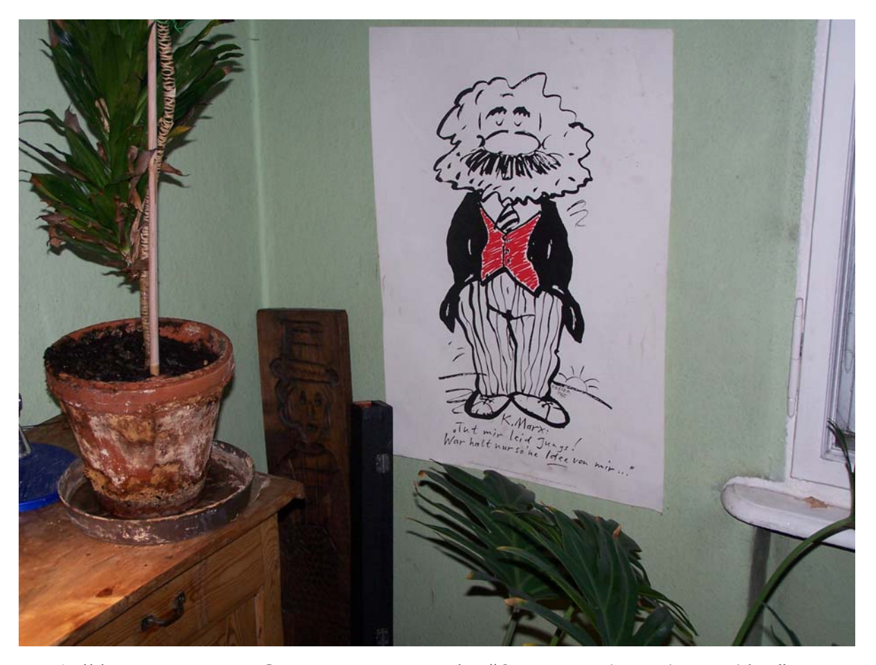
Well known 1990 East German poster. It reads: "Sorry guys, it was just an idea."

Mostly, I made my march for the memory of this man, whose idea was just an idea. But he also had lots of just ideas, many of which he told to his dog and which have been passed from dog to dog for many years (dogs do not write, but do have a strong olfactory tradition).